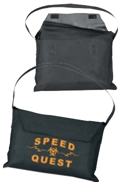
Table Throw Bags